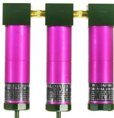
P/N 21999-0421 Tsunami™ 3-stage Filter System (separator / oil coalescing / activated carbon)