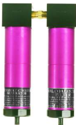
P/N 21999-0424 Tsunami™ 2-stage Filter System (separator and oil coalescing filter)