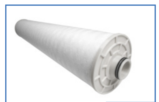
Figure 1: High Flow Z Filter Inset picture: ergonomic designed handle for easy replacement