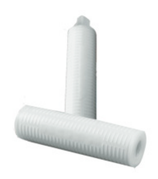
figure 1: Flotrex HR pleated filters