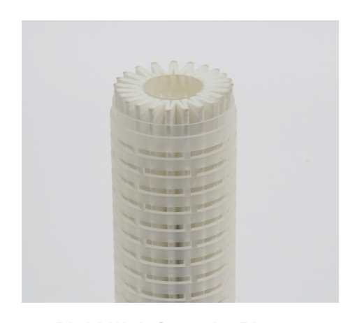
Rigid High Capacity Pleats

This chart represents typical water flow per 10" cartridge length. The test fluid is water at ambient temperature. Extrapolation for multiple elements tends to be linear, but as flows increase the \Delta of the housing becomes more apparent