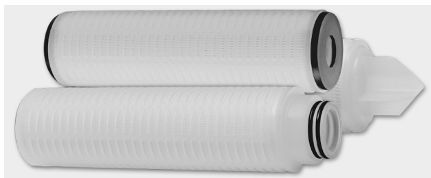
figure 1: XPleat GF filters