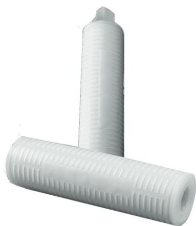
figure 1: Flotrex HR pleated filters