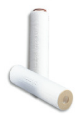
figure 1: Selex depth cartridge filters