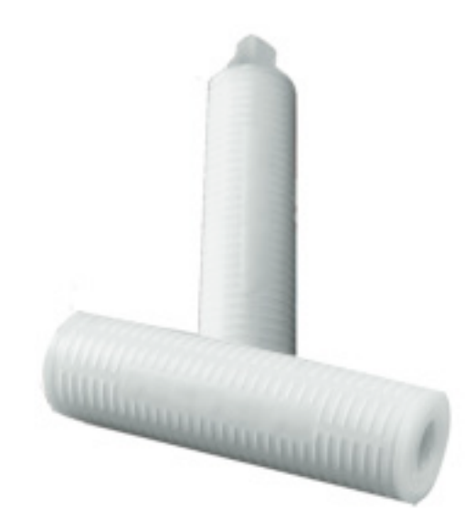
figure 1: Memtrex NY filters