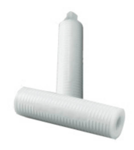
Figure 1: Memtrex KM Filters