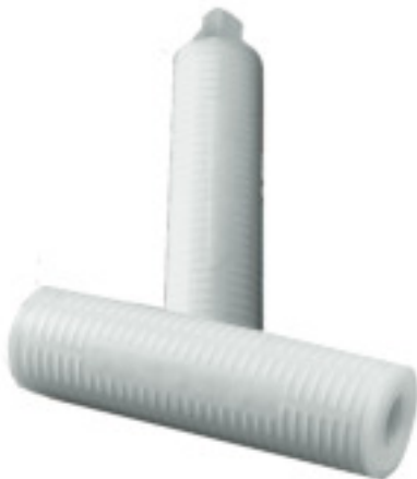
Figure 1: Memtrex HFE filter

Memtrex* HFE are made entirely from fluoropolymer materials including Halar (ECTFE). Halar is a trademark of Ausimont.), and PTFE. Halar is an industrial-grade fluoropolymer with excellent solvent resistance. MHFE benefits of the edge lamination technology assuring a lower pressure drop and increasing flow rate. MHFE filters can withstand the harshest process conditions due to its construction using these highly resistant materials. Providing broad chemical compatibility, you can count on our filters to produce consistent, uniform process streams in your most demanding filtration applications. MHFE deliver high flow rates and high purity results with absolute rated efficiencies (99.9% filtration efficiency at rated pore size based on ASTM F795 and F661 test methods) and retention characteristics that outperform other filters.