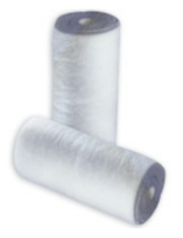
figure 1: Aquatrex filters