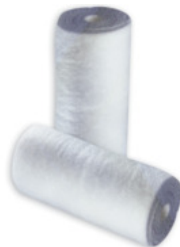
Figure 1: Aquaplex LD Filters